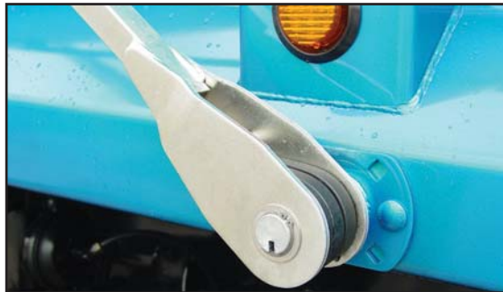
Flat coil torsion spring (5000XL Series)