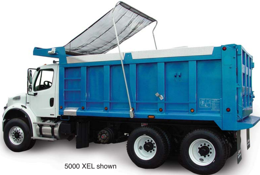
5000 XEL shown