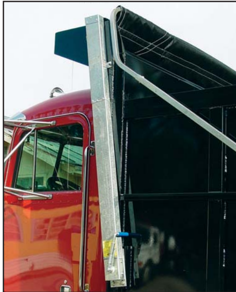
Ground level crank (5000XGL)