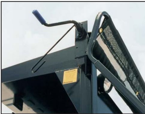
Cab level crank (5000XCL)

Donovan Enterprises • 3353 SE Gran Park Way • Stuart, FL 34997 email: info@donovan-ent.com • 800-327-8287 • www.donovan-ent.com • 772-286-3350