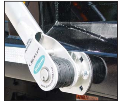
Universal Pivot Mount w/ flat coil torsion springs