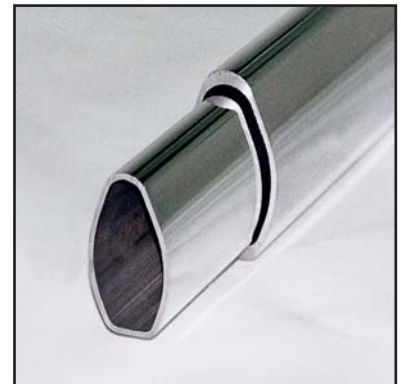
Sleek Bullet shaped profile